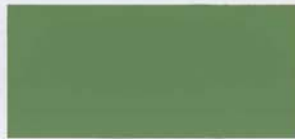
RAL 6021 PALE GREEN