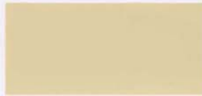
RAL 1015 LIGHT IVORY