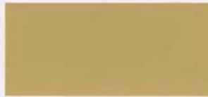
RAL 1001 BEIGE