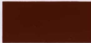
RAL 3009 TILE RED