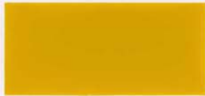
RAL 1003 SIGNAL YELLOW