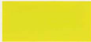
RAL 1018 ZINC YELLOW