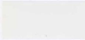
RAL 9003 SIGNAL WHITE