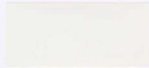
RAL 9016 TRAFFIC WHITE