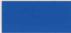
RAL 5015 SKY BLUE