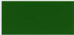
RAL 6001 EMERALD GREEN