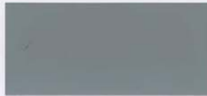
RAL 7040 WINDOW GRAY