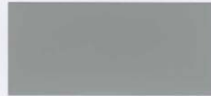
SC-0001 OXFORD GRAY