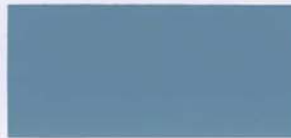
SC-0008 COLONIAL BLUE